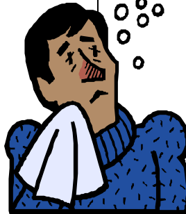
Chronic sinus infections are the #1 chronic illness in the United States according to the CDC

AEGIS Environments has put together this booklet with consulting allergists to inform you about indoor environmental problems and their practical solutions. Your use of these hints, along with proper medical care, will clearly reduce the sources of pollutants in your home and improve you and your family's ability to cope with all of the stresses that affect your health and well being.