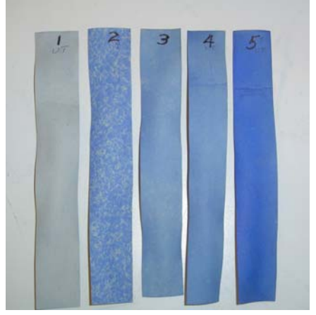
Fig. 4. BPB test results on wallboard paper.

The non-leaching, bonded antimicrobial is readily detected by staining the treated substrate with a water-soluble anionic dye, bromophenol blue—or BPB. The anion of the aqueous sodium salt of BPB complexes with the cation of the polymerized antimicrobial - resulting in a blue color on the treated substrate. An untreated substrate will retain its original color. The entire procedure takes only a few minutes and all you need is running water to perform the test.